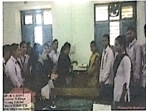
Student doing analysis of the some Chemical Samples by Spectrophotometer